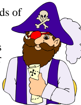
(questions 1 – 11)

The word pirate means 'sea robber'. For hundreds of years pirates sailed the oceans and seas looking for ships to rob. From 1500 to 1700 many peaceful sailing ships were attacked. The pirates captured or killed the crew and stole the cargo or treasure. Pirates often hid on tiny islands or along the coast. Even though pirates were cruel and did not obey the law, they did obey their own laws of the sea. They were very kind to each other and always shared whatever they had stolen equally. They always took care of hurt or sick pirates.